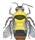
Bombus frigidus frigid bumble bee