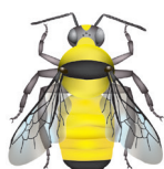
Bombus borealis boreal bumble bee

Yellow top & front of head. Sides of thorax with brown.