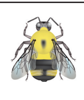
Bombus insularis indiscriminate cuckoo bumble bee

Ab 6 strongly curled under abdomen. Ab 1 sometimes black.