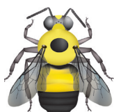
Bombus auricomus black and gold bumble bee

Large eyes. Ab 4-7 black. Hair on thorax varies, black in center or all yellow. Sometimes yellow on Ab 4.