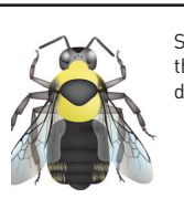
Bombus citrinus lemon cuckoo bumble bee