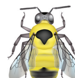
Bombus insularis indiscriminate cuckoo b.b.