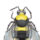
Bombus ashtoni Ashtons cuckoo b.b.