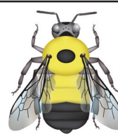
Bombus sandersoni Sanderson's bumble bee

Queen. Black on top of head. Round face.