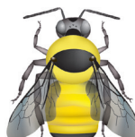
Bombus pennsylvanicus American bumble bee

Yellow top & front of head. Sides of thorax with brown.