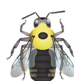
Bombus variabilis variable cuckoo bumble bee