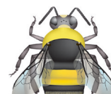
Bombus terricola yellowbanded bumble bee

Eyes slightly enlarged. Few yellow hairs between wing bases. Few black or red hairs at edge of Ab 2. Color variable.