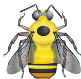
Bombus nevadensis Nevada bumble bee

Large eyes. Ab 4-7 black. Hair on thorax varies, black in center or all yellow. Sometimes yellow on Ab 4.