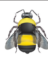
Bombus auricomus black and gold bumble bee

Yellow on middle edge of Ab 1. Long spine on hind basitarsus.